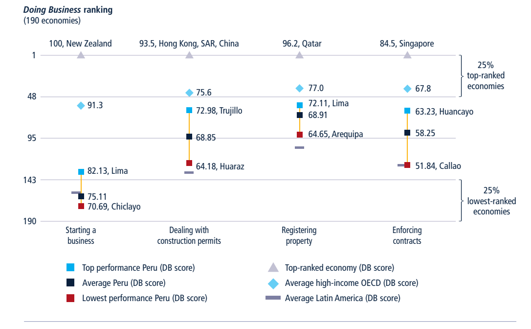
FIGURE 1.2 The magnitude of the differences between Peruvian cities is easier to appreciate when viewed in a global context

Note: The ranking of the 190 economies is based on the Doing Business score for each of the four areas measured. The averages for the high-income OECD economies are based on the data for each of the 34 economies that belong to that group, including Chile. The Latin American rankings are based on data from 19 economies, excluding Chile and the Caribbean islands. The data and comparisons made with other global economies throughout the study correspond to capital cities or the most important business cities, in line with how they are measured in the global Doing Business study.